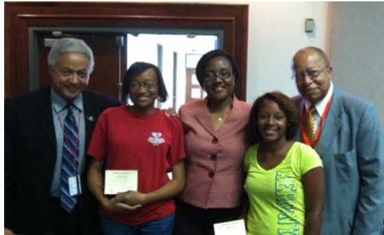
Tuskegee University Representatives and TRiO Participants