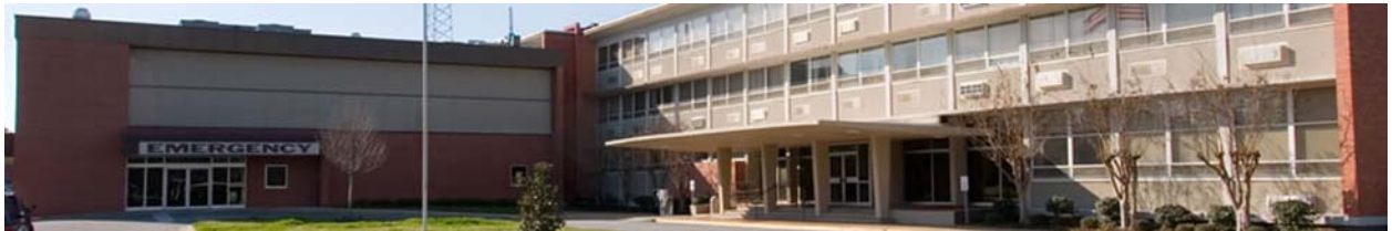
Medical Center Barbour Hospital in Eufaula, AL